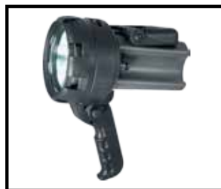
Upper pistol profile