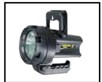
Lower lantern profile