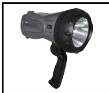
Upper pistol profile