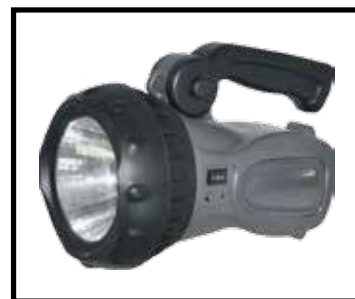
Lower lantern profile